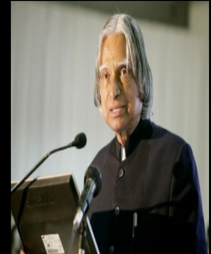
BSC-2010 Dr. APJ Abdul Kalam HE Former President of India