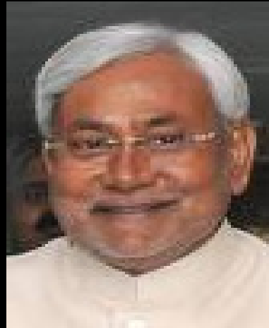
Sri Nitish Kumar Hon'ble Chief Minister Govt. of Bihar