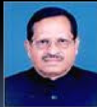
Sri Awadhesh N. Singh Hon'ble Former Labour Minister Govt. of Bihar