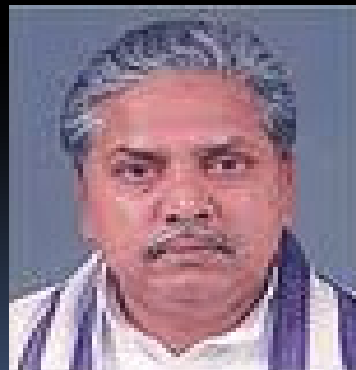
Sri Prem Kumar Hon'ble Road Construction Minister Govt. of Bihar