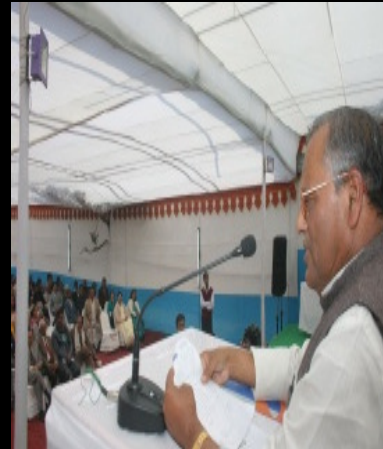
Sri Hari Narayan Singh Hon'ble Former HRD Minister