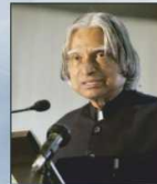
Dr. APJ Abdul Kalam H.E. Former President of India BSC-2010