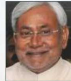
Sri Nitish Kumar Hon'ble Chief Minister Govt. of Bihar